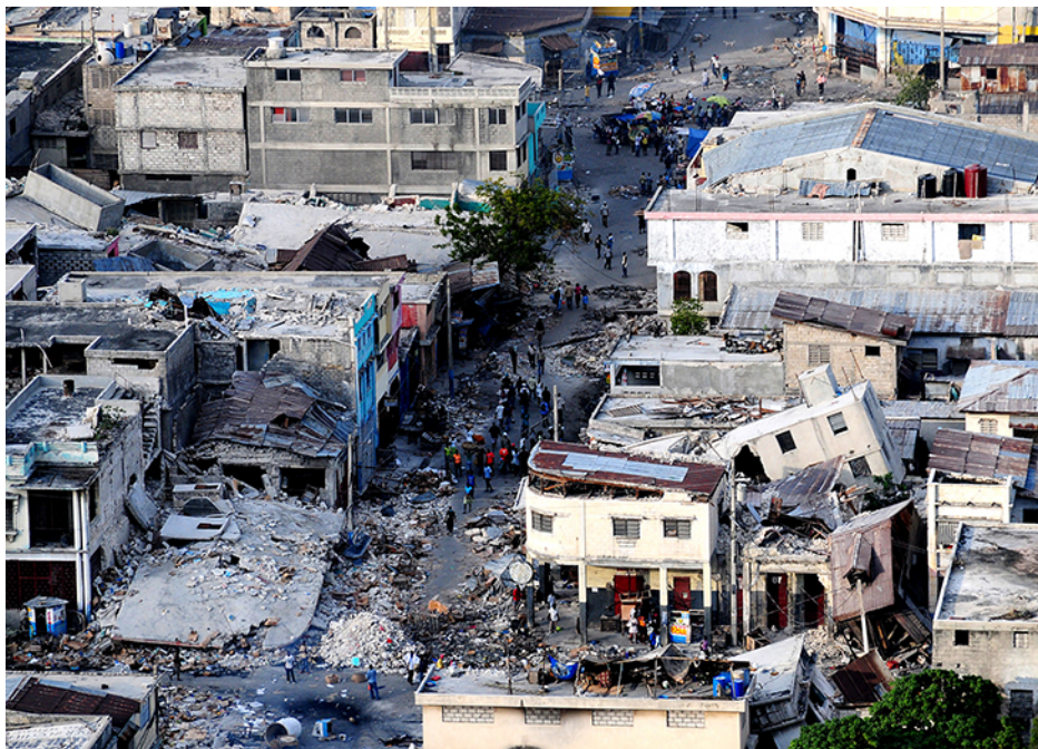
Figure 16.15 The destructive effect of an earthquake is observable evidence of the energy carried in these waves. The Richter scale rating of earthquakes is a logarithmic scale related to both their amplitude and the energy they carry.

In this section, we examine the quantitative expression of energy in waves. This will be of fundamental importance in later discussions of waves, from sound to light to quantum mechanics.